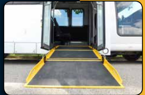
40" entry door with kneeling ramp*