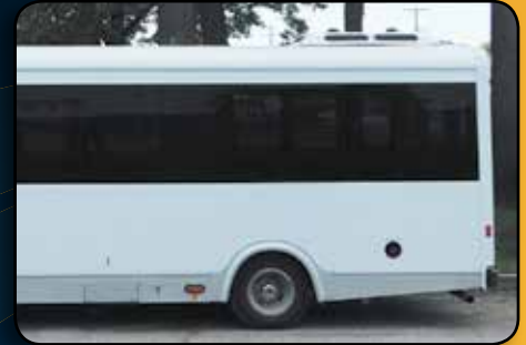
Upgraded bonded windows and stainless steel inserts*

Specifications subject to change without notice. GVWR = Gross Vehicle Weight Rating.