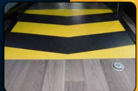
Altro safety floor insert*