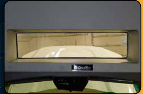
Large observation window upgrade*

Specifications subject to change without notice; GVWR = Gross Vehicle Weight Rating.