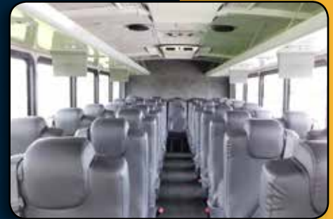
Optional overhead luggage bins, reading lights, Esquire Seating, entertainment package and roof hatch*