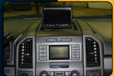
Multiple rear observation systems available*

Take your virtual tour at www.glavalbus.com