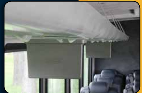
Multiple entertainment packages available