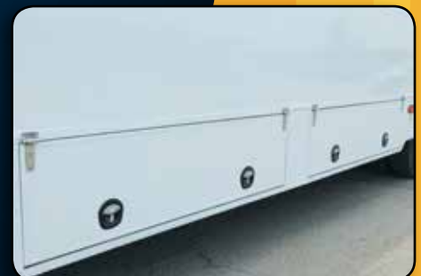
Available single and dual under floor storage